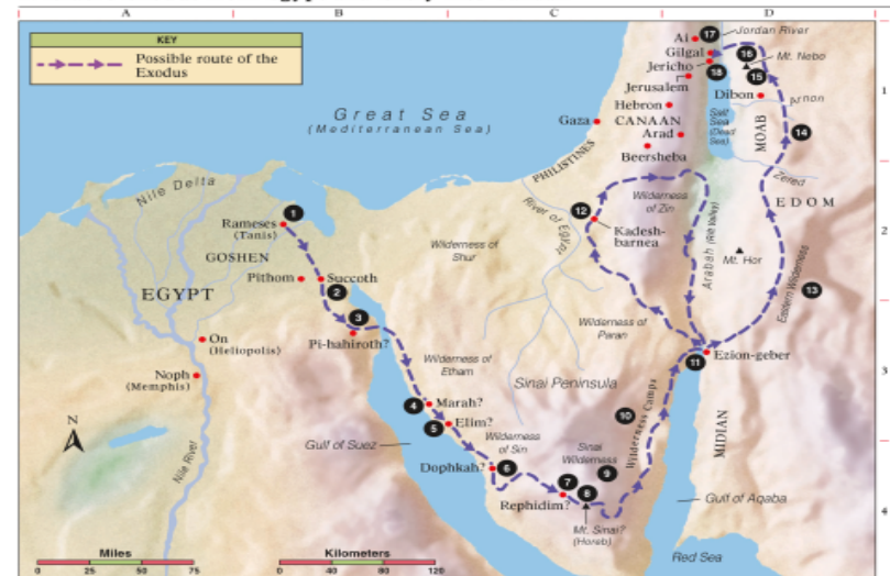
2. Israel's Exodus from Egypt and Entry into Canaan

1. Psalm 62 - Trust in him at all times; ye people, pour out your heart before him: God is a __ for us. Selah.